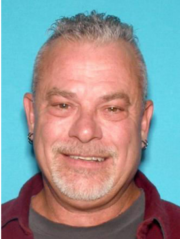
Pride in Community - Excellence in Service